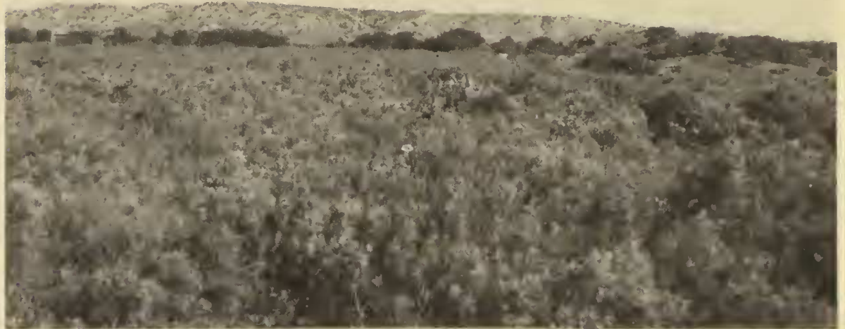
FIG. 6.—Canadian River floodplain between Borger and Stinnett, Hutchinson County. Salt cedar in foreground, breaks south of river in distance.